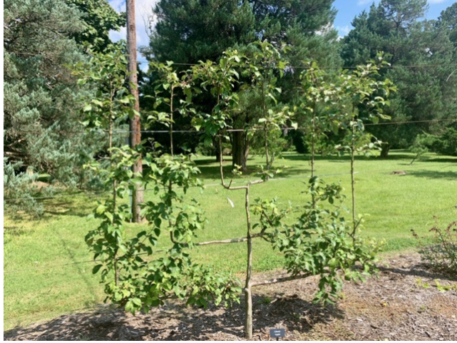
Photo above – A great example of a plant that has been espaliered at Memphis Botanic Garden.

garden. The technique of “espalier” is a great addition to any garden but is especially useful where space is at a premium. It is the ancient practice of formally training a woody plant against a wall, trellis or fence. The branches are pruned and tied to follow the lines of the support. Take a look at the short video attached to learn how EASY it is to espalier a Sasanqua camellia. They grow so well in our area. If you have an example of espalier in your garden, please send us photos to share. We love to learn together!