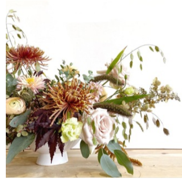
Arrangement by Everbloom Design