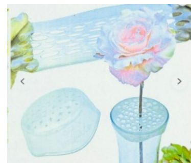
Budable is a handmade polymer, self-sticking, flexible, stretchable, stem