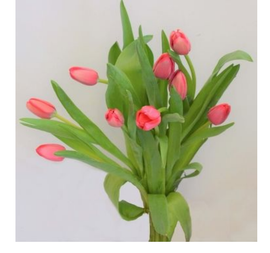
Tip Toe Through The TULIPS...

For long lasting tulips, purchase closed buds that are just beginning to show some color. Once home, recut the stems by at least 1/2 inch and remove all leaves that will be under the waterline of the vase. Place the freshly cut tulips in lukewarm water. Cold water is not recommended for hydration of tulips. Use a floral food if available. If the tulips come packaged in plastic from the store, cut 1/2 inch from the stems at an angle then leave the wrapping in place for a few hours to support the stems while the tulips drink up the fresh water. Remove the plastic wrapping and the tulips will maintain that upright position because they have been hydrated and conditioned.