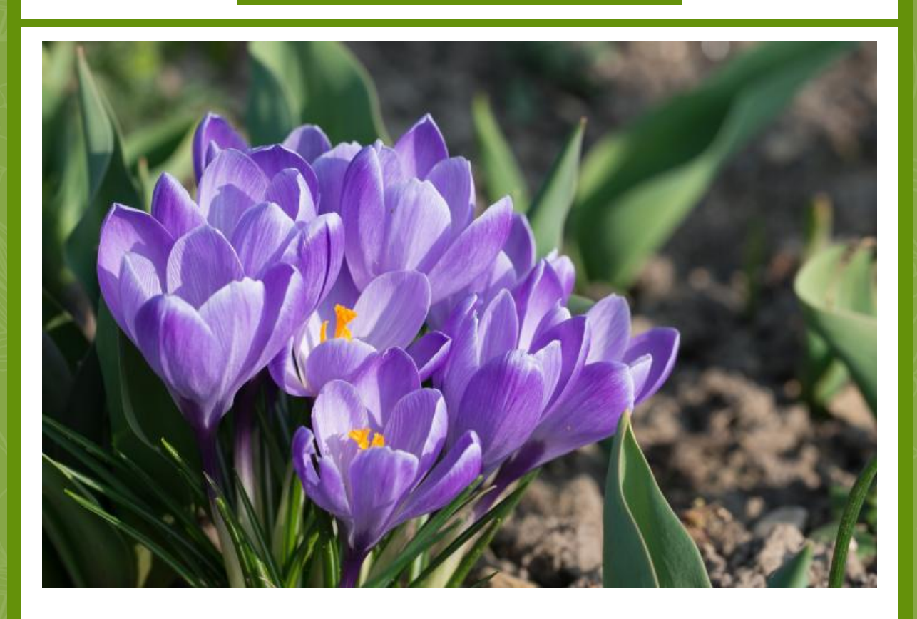
Dear March - Come In-

Dear March - Come in How glad I am I hoped for you before Put down your Hat You must have walked How out of Breath you are Dear March, how are you, and the Rest Did you leave Nature well Oh March, Come right upstairs with me I have so much to tell -