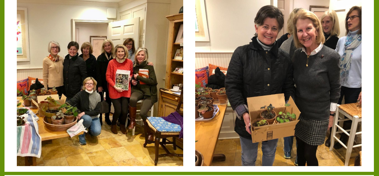
The Memphis Botanic Garden has recently planted more than 37,000 bulbs around the grounds, so the Garden will EXPLODE with color when spring arrives!

A donation has been made in your honor to support the planting of thousands of spring-blooming bulbs at Memphis Botanic Garden!