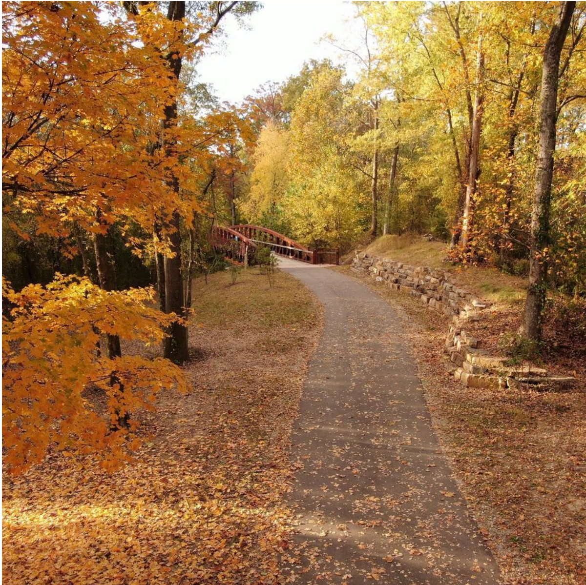
Wolf River Conservancy

THE LITTLE GARDEN CLUB OF MEMPHIS Member of The Garden Club of America