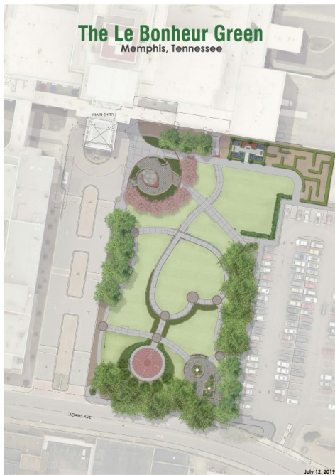
The Le Bonheur Green Memphis, Tennessee