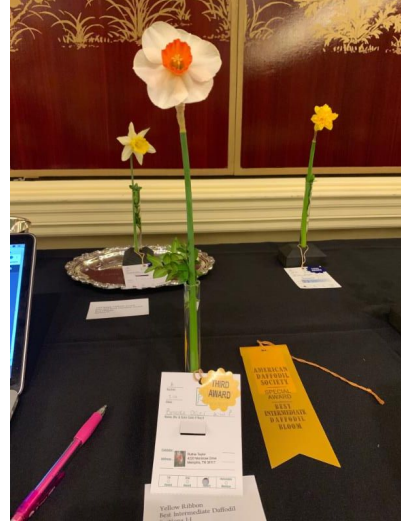
This is Ruthie's yellow ribbon for best intermediate daffodil. The flower's name is "Brooke Ager"