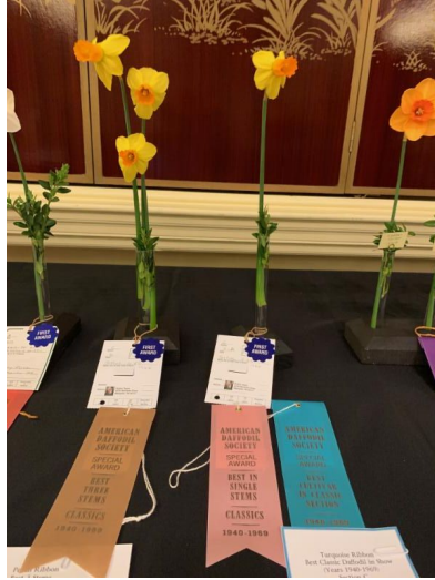
These are also Ruthie's ribbons. The one on the left is best three stems of a classic daffodil. The name of the flower is "Jetfire." The two ribbons on the right are for the same entry. The first is the best single stem classic. The second is the best cultivar in the classics. These are also "Jetfire." Classics are daffodils introduced between 1940 and 1969.