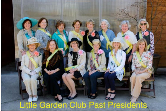
Little Garden Club Past Presidents