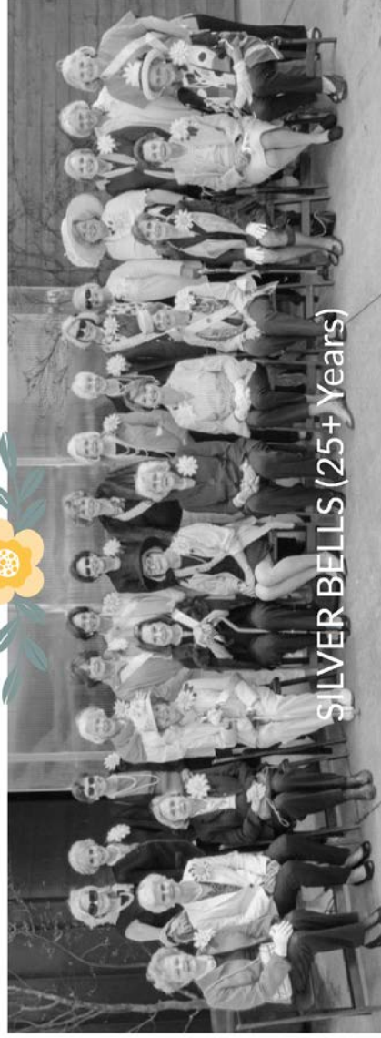
SILVER BELLS (25+ Years)